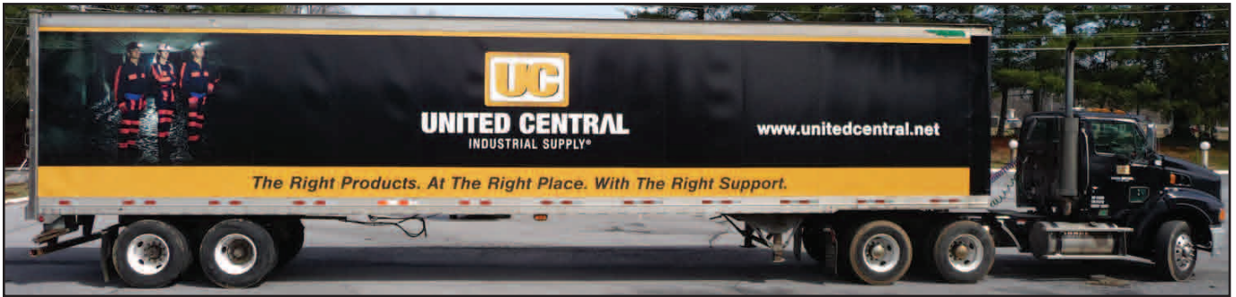
Part of United Central's fleet of 250+ delivery vehicles.